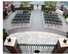
The Courtyard 2,200 SQ FT FIRST FLOOR