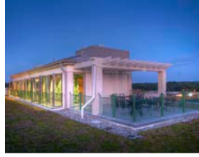
Cloud Club 486 SQ FT ROOF LEVEL