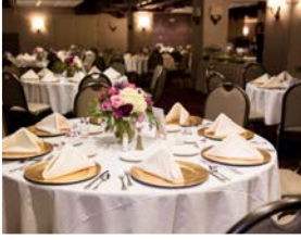
Big Four Ballroom 1,775 SQ FT LOWER LEVEL