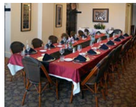
Richard E. Ford Dining Room 425 SQ FT FIRST FLOOR

Due to its semi-private design and proximity to restaurant Twenty, the Gatsby Room is available for breakfast, lunch, and dinner events only.