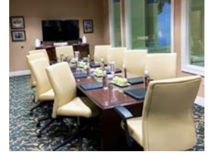
Ridenour Conference Room 360 SQ FT SECOND FLOOR