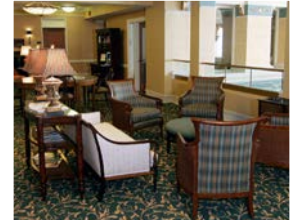
Virginia Ford Mezzanine Lobby 900 SQ FT SECOND FLOOR