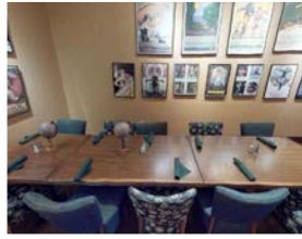
Gatsby Room 400 SQ FT FIRST FLOOR

Due to its semi-private design and proximity to restaurant Twenty, the Gatsby Room is available for breakfast, lunch, and dinner events only.