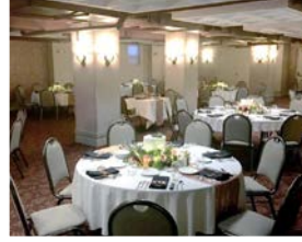
Wabash Cannonball Room 2,128 SQ FT LOWER LEVEL