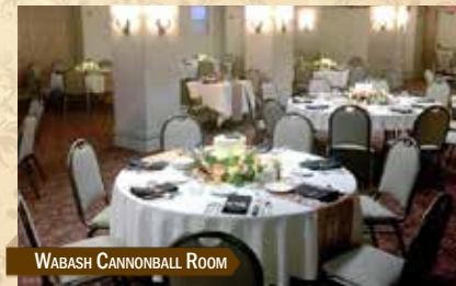
WABASH CANNONBALL ROOM