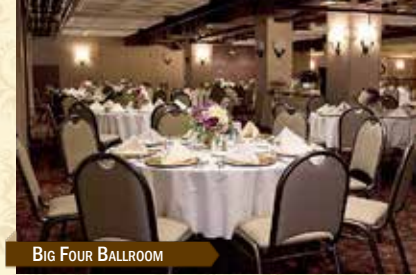
BIG FOUR BALLROOM