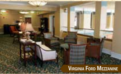
VIRGINIA FORD MEZZANINE